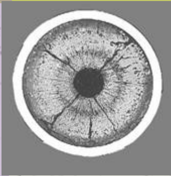
Microstructure and macrostructure of irradiated (U, Np)O 2 fuel, 19% burn-up