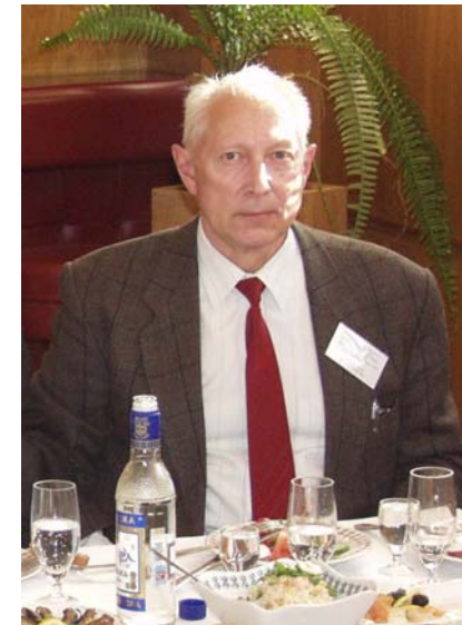
CEG-Meeting, Brussels 2006